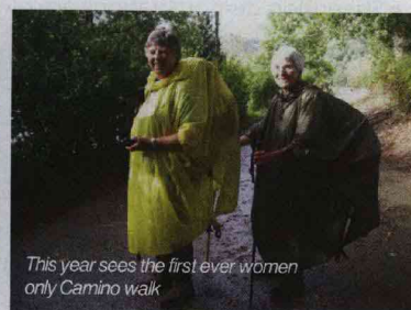
This year sees the first ever women only Camino walk