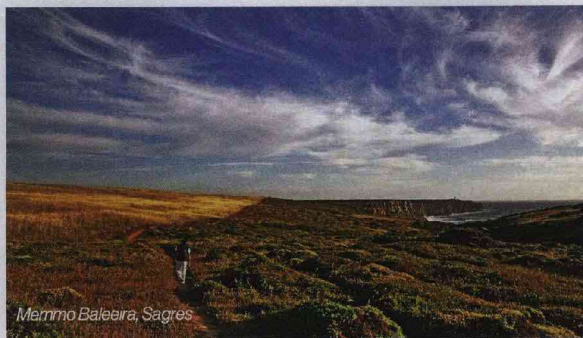
Memmo Baleira, Sagres