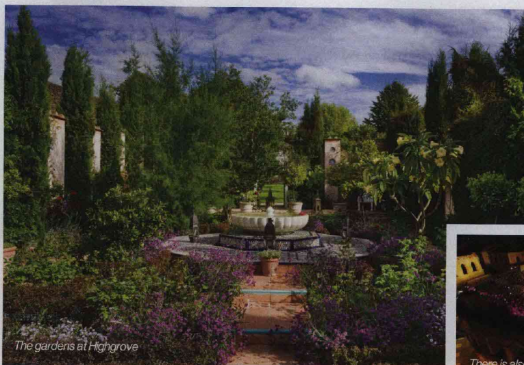
The gardens at Highgrove

Lorna Hogg looks at some options beyond the ordinary.