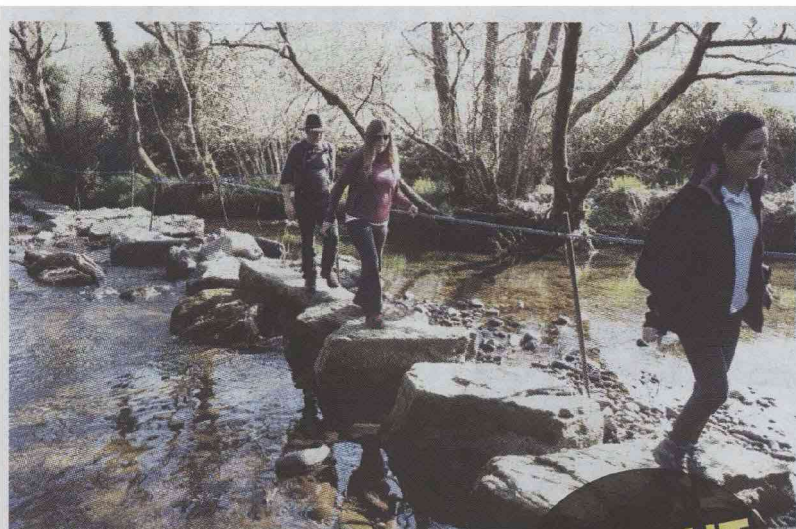
Kerry Camino Festival, April 29-May 2

No matter what you're into, there's an outdoor adventure with your name on it over the coming weeks