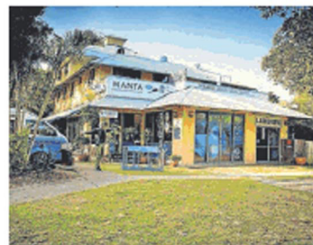
Stradbroke Island YHA is a base for spotting manta rays, dolphins and loggerhead turtles.

YHA's Australian summer specials are priced from $99 a person for two nights and include opportunities such as snorkelling on Stradbroke Island, exploring caves at Kosciuszko, hiking the Grampians or getting up close to wildlife in South Australia's Port Elliot. The Straddle Ocean Adventure and Snorkelling Tour, for instance, is priced from $160 a person for two nights in a double/twin room and includes a half-day guided ocean snorkelling tour plus return ferry tickets to Stradbroke Island. Head out by boat to spot manta rays and dolphin pods. Visit www.yha.com.au .