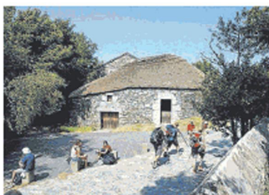
O Cebreiro village on the Camino Way in Galicia.

Honolulu's iconic Waikiki Beach, with Diamond Head in the background.