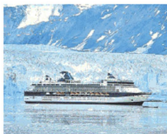
Celebrity Millennium sails by Alaska's Hubbard Glacier.