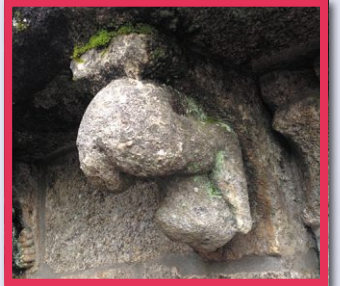
GIANT INCENSE BURNER: The botafumeiro in the cathedral, the Abastos market in Santiago and the cheeky bishop's backside gargoyle on the cathedral roo