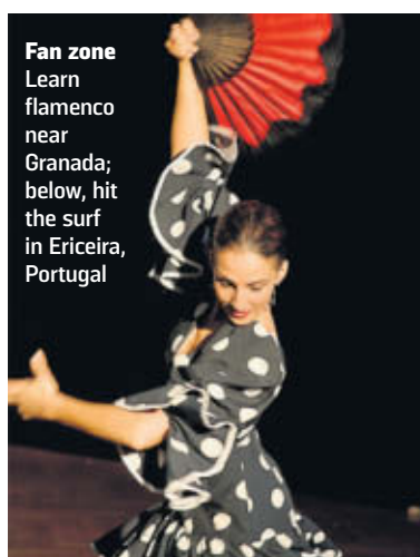
Fan zone Learn flamenco near Granada; below, hit the surf in Ericeira, Portugal

into a week-long adrenaline rush though the Sierra de Grazalema park and the Guadiaro Valley. The result is a single-track-dominated trip involving challenging descents and some nasty technical trails, with thigh-busting uphill sections, following mule tracks, mountain roads and the odd goat path. It's aimed at riders ranging from keen amateurs to heavily scarred experts: beginners need not apply. Prices start at €1,284pp, half-board, with bike hire from €186 (00 44 1912 651110, skedaddle.co.uk ). Flights are extra; head to Malaga with easyJet.