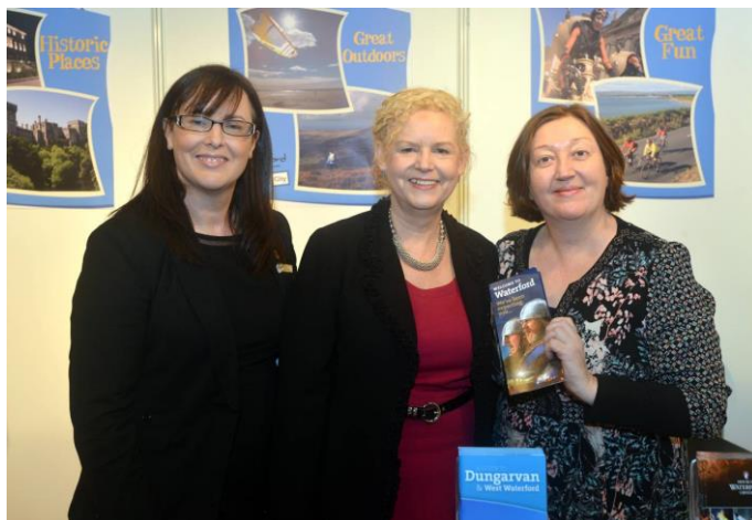
Team Waterford at Holiday World 2015

Think Waterford had a big 2014, celebrating its 1,100th birthday? It's only getting started. Now that its city and county council have amalgamated, they'll be rebooting the Waterford brand with a big splash this March. Watch out for a new Greenway coming down the tracks too. Show-only deals include a Golden Years Break at the Tower Hotel – offering three nights' dinner and B&B from €149pp.