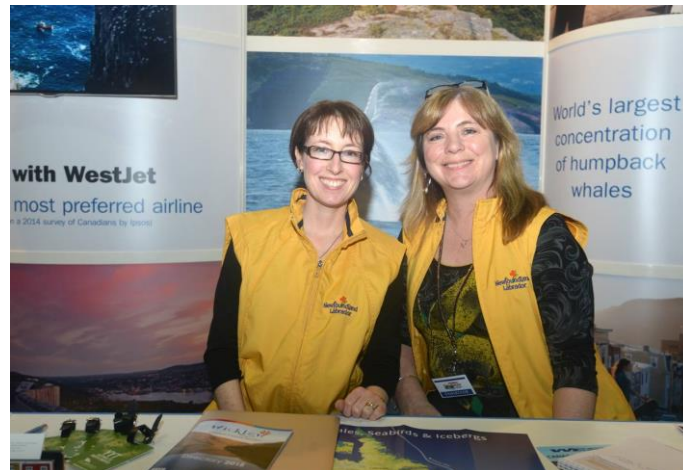
Newfoundland's stand at Holiday World.

Did you know Newfoundland is home to the world's largest concentration of humpback whales? That it's the only place to see icebergs in North America? Or that direct flights from Dublin have been taking as little as 3.5 hours, thanks to helpful tailwinds? I learned all of this today. Flights from Dublin to St. John's are available with WestJet from €128 each way, in a sale ending January 27.