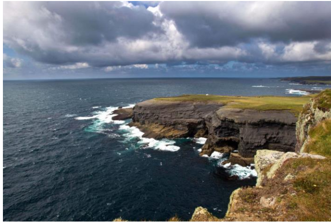
The Wild Atlantic Way

Loop Head, the desolately beautiful Co. Clare peninsula, is going from strength to strength. A new, 76km cycling loop set to open this May bank holiday weekend. Yet another reason to visit!