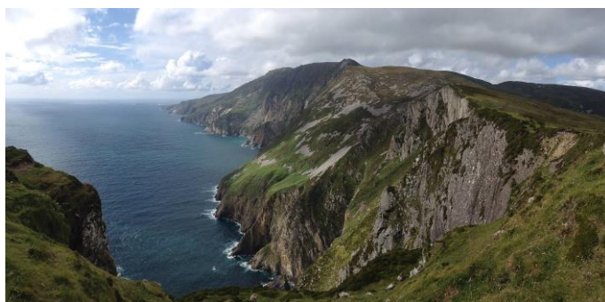
Slieve League Peninsula, Donegal

Aer Lingus Regional will be taking over Flybe's direct flights from Donegal to Glasgow and Dublin as of February 1st. The flights are available from €34.99 each way. The airport also offers 'Fly Breaks' on its website ( donegalairport.ie ) I've just