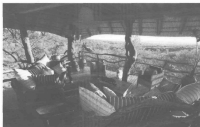
Top, Tour St Therese, Vendee, France (€2,000 and under); above, South African Safari (Blow the Budget); top right, Chiesa del Carmine (Blow the Budget); bottom right, Coconut Bay, St Lucia (Blow the Budget)