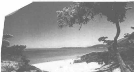
Above, Portugal's Algarve, a long-time favourite with Irish families (€1,500 and under); left, Sardinia is becoming an increasingly popular choice (€3,000 and under)