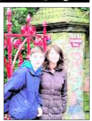
IN TUNE: At Strawberry Fields

now. For more informatic www.michellejackson.ie