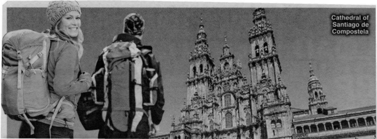
Cathedral of Santiago de Compostela