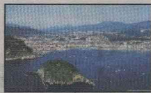
START POINT: San Sebastian

Famous pilgrimage is a special experience